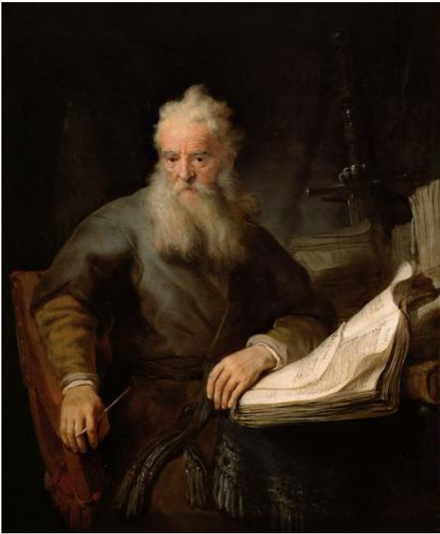
Rembrandt Harmensz van Rijn, "St. Paul at his Desk," 1633

In the frame of Theo 313/424, the Cody Chair invites faculty and graduate students to an Advanced Graduate Seminar